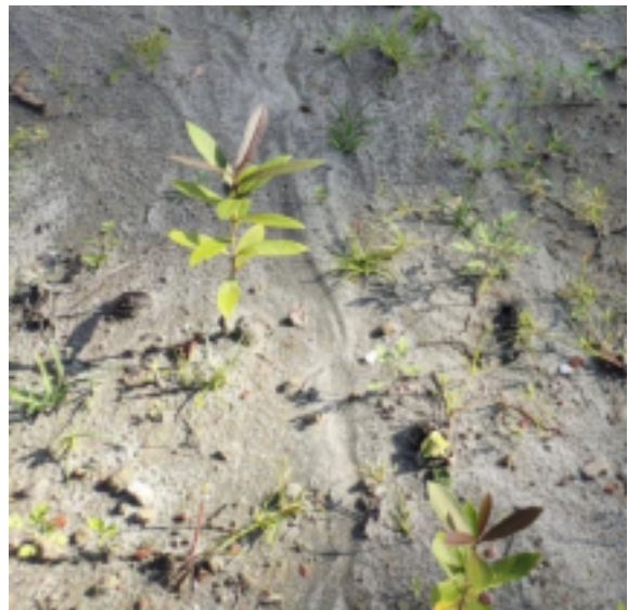
Natural Regeneration of Arjun tree