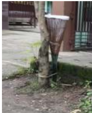
Dustbins made of bamboo used by the College