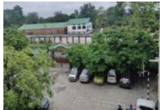
Green Campus Initiative (Natural Car Shed)