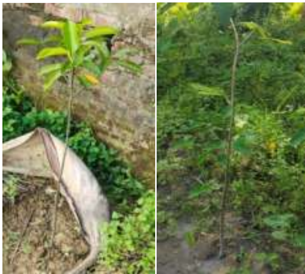
New saplings of Bokul and Rain tree