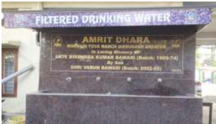
Water filter and drinking water tank with taps