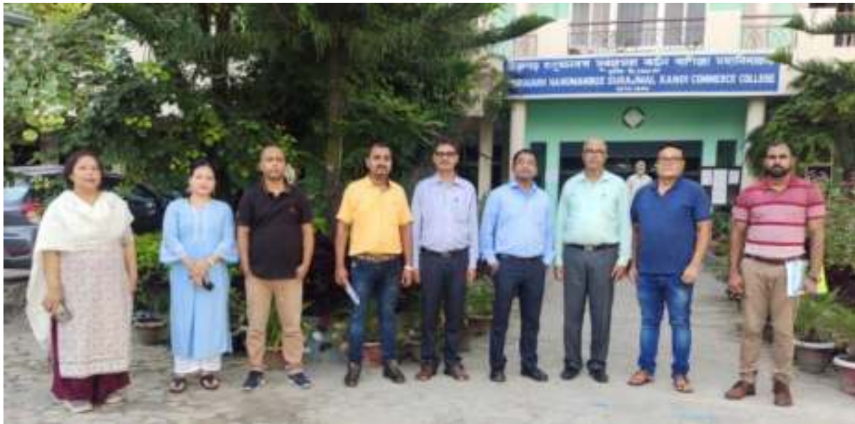
A group photo with the Principal and faculty members