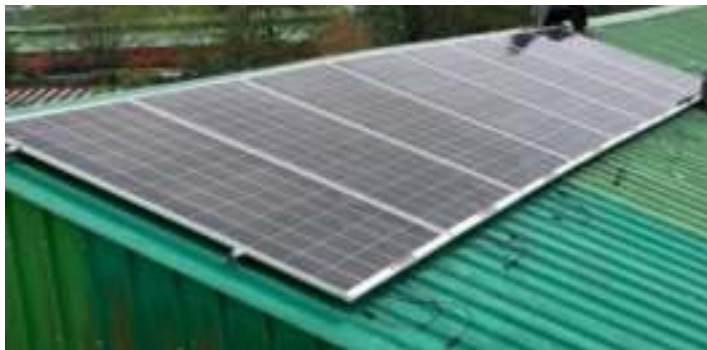
Solar Panel on the roof top