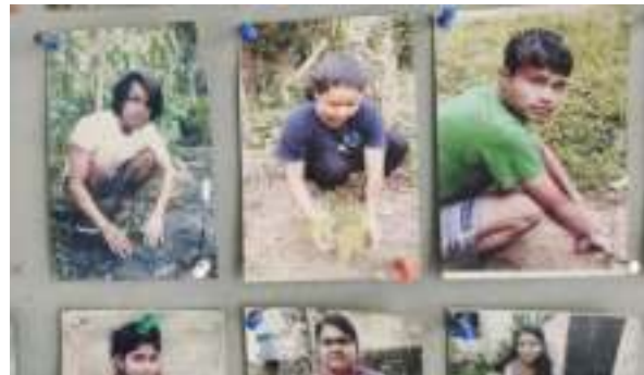
Photos of Plantation programmes of the College