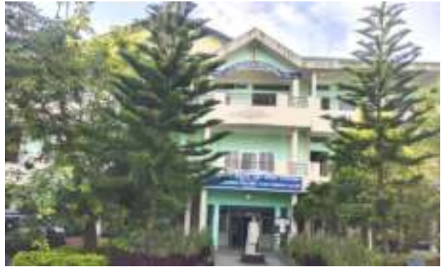
A view of the campus