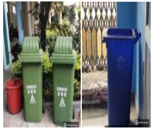
Maintenance of two types of dustbins