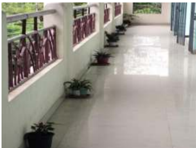
Green Campus Initiative- Indoor Plants