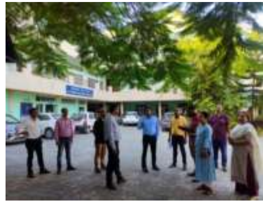
Discussion with the faculties