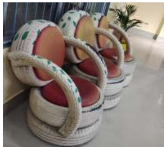
Chair made from used Car Tyre