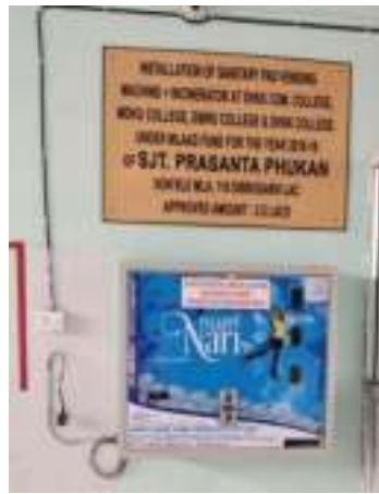
Sanitary napkin incinerators